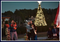
CHRISTMAS AT THE LAKE!!!!