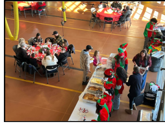
HOPE MILLS BREAKFAST WITH SANTA!!! Children were treated with a visit from Mr. and Mrs. Clause over breakfast.