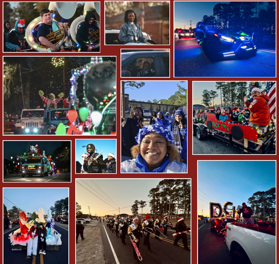
THE HOPE MILLS PARADE OF LIGHTS!!!! The Hope Mills Parade of lights was a huge success!!!

Hope Mills Parks and Rec is partnering with the Hope Mills Fire Department to bring Santa to Town!!! Join us as Santa drives through Hope Mills with our firefighters on December 16th, 17th, 18th, and 19th!!! Contact the Parks and Rec department for more details.