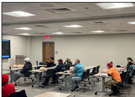
The Hope Mills Fire Dept. trained 18 members of staff in CPR in an effort to keep us up to date on certifications.